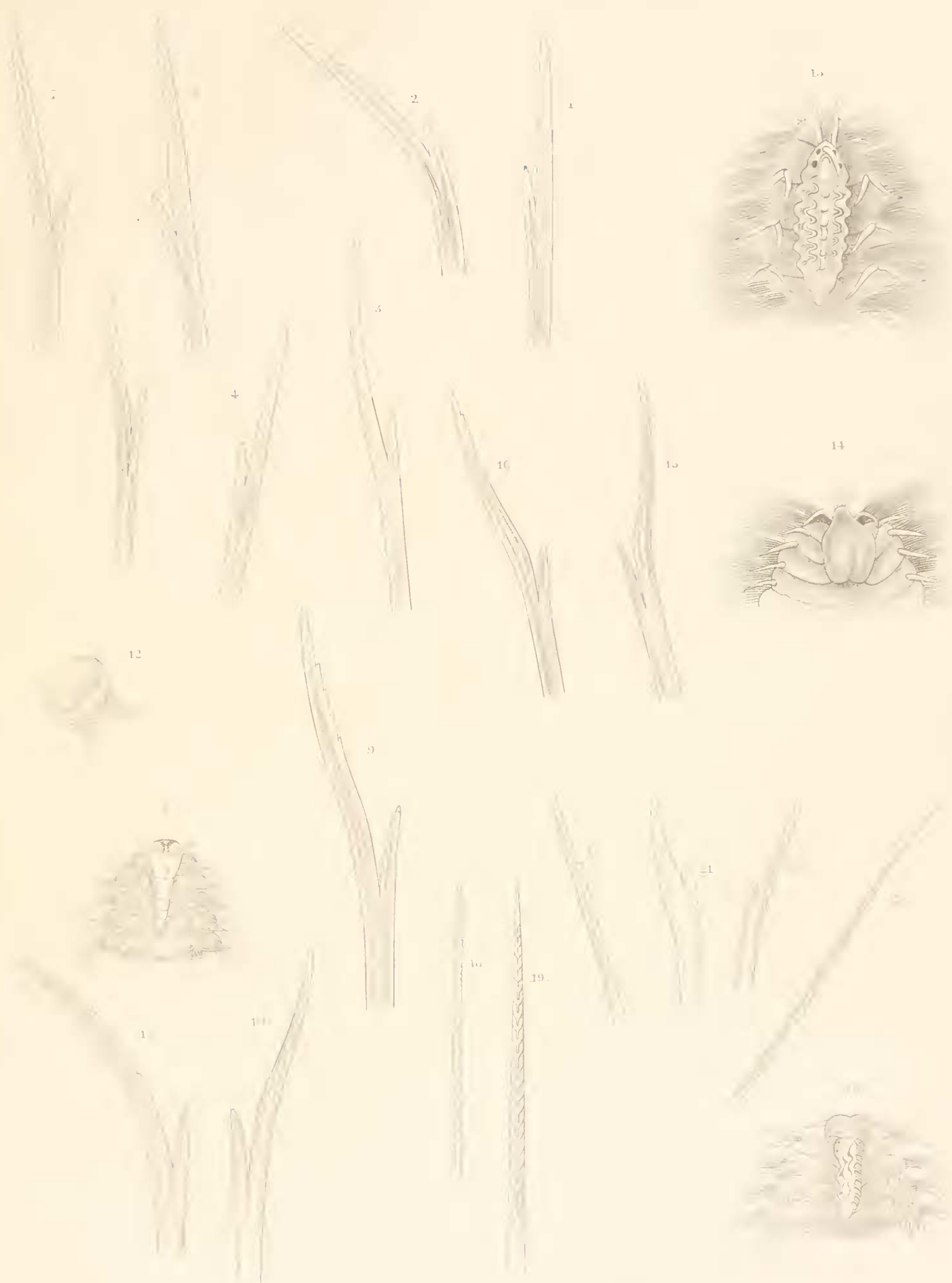
Fig 8 et 12 autor, cet. Ch. F. H. Dumont del.